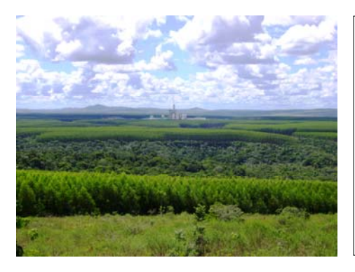
Figure : Veracel mill and plantations with restored Atlantic rainforest in the valley

http://www.veracel.com.br/web/en/sustentabilidade/ => the Veracel Station